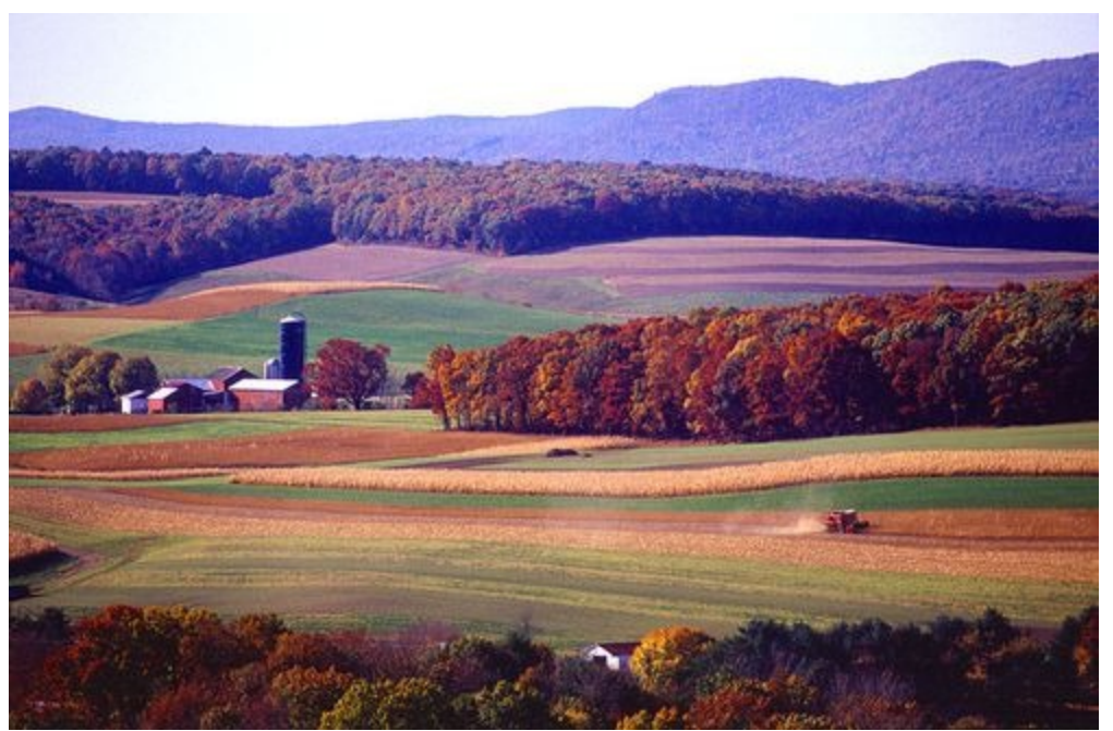
Agricultural Research Service